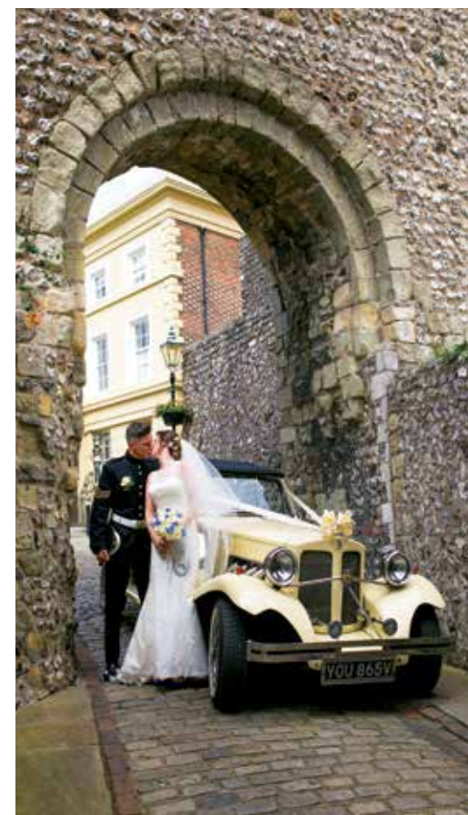
Photograph: Top left and above Daniel Beckley, Flashback Photography